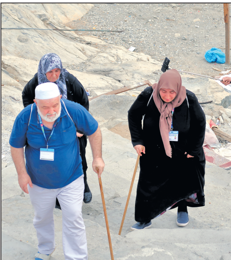
Age is no barrier when it comes to following the path of Nabi Muhammad (SAW).