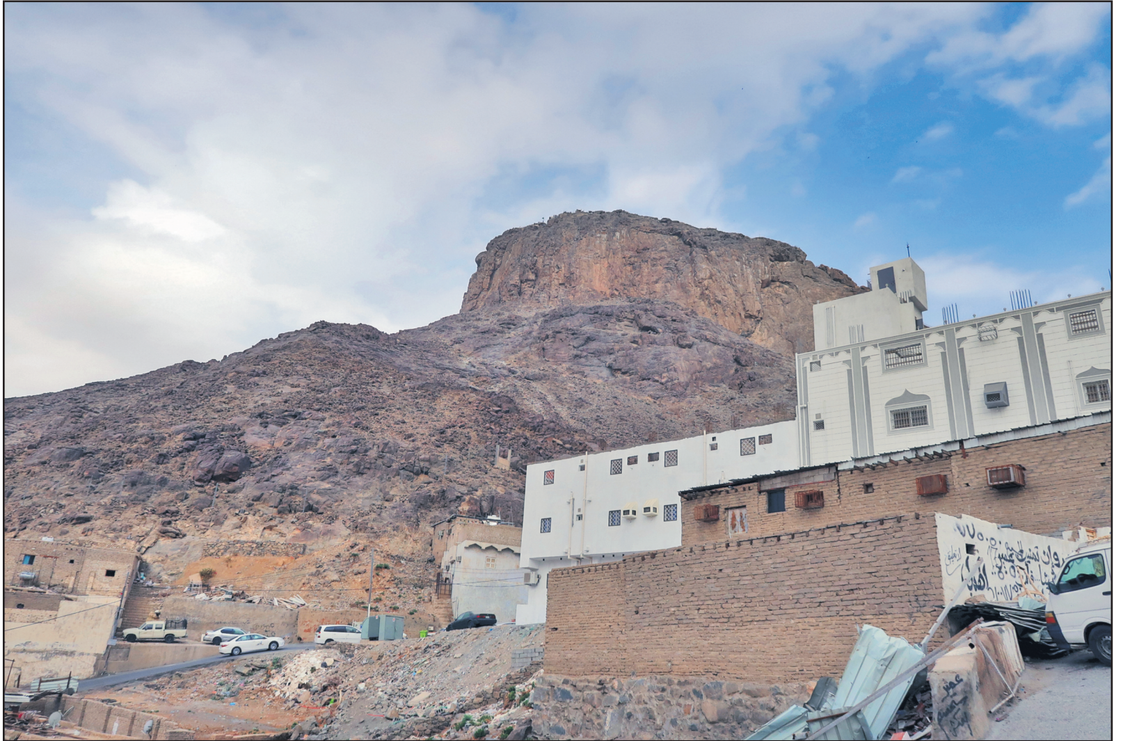
The shape of Jabal Noor resembles a mountain on top of another.