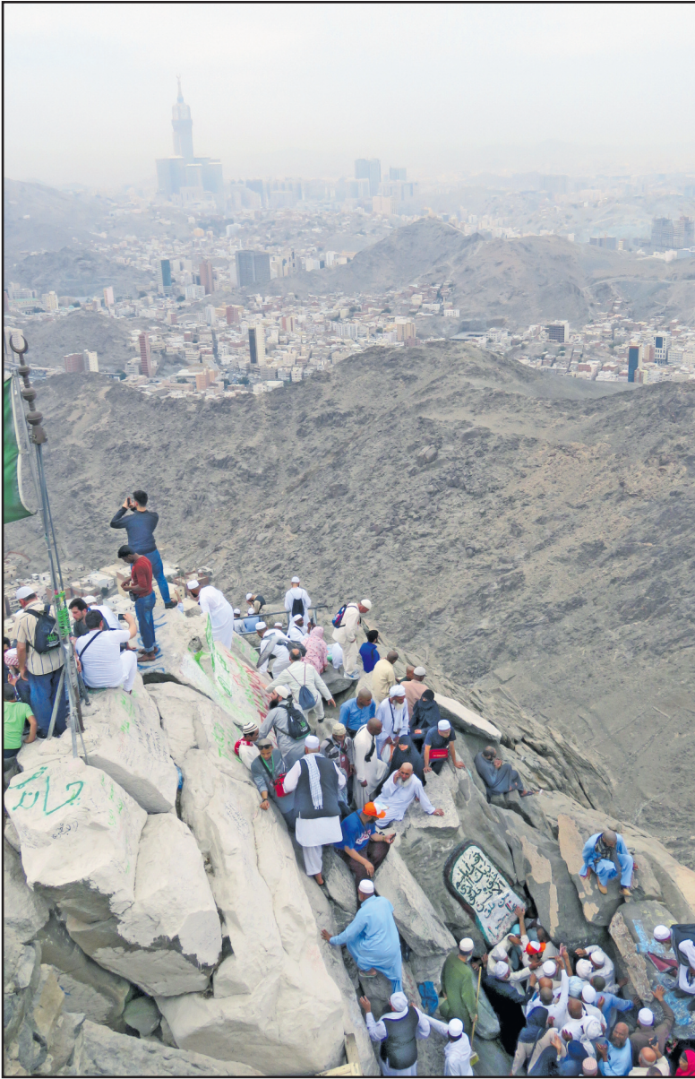
The Cave of Hira with Makkah in the background. Here we get some idea of how far Nabi Muhammad (SAW) went to spend time in seclusion in the Cave of Hira, on Jabal Noor, about three kilometres from Makkah. Nabi Muhammad (SAW) spent many days in the cave before he received the first revelation.