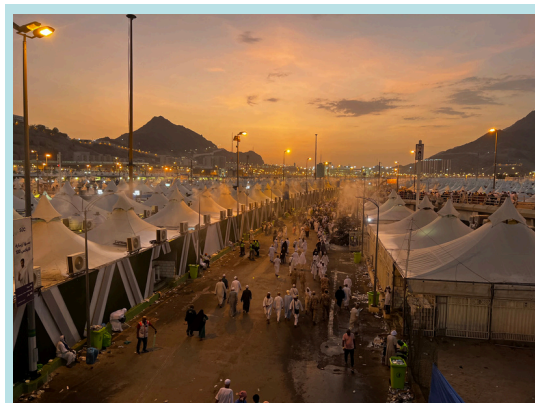
Together on Hajj this time.

I reminded him how we had all prayed on Arafat two years earlier for her recovery. 'Did you make Du'aa on Arafat that one day she would stand there with you?' I asked. 'I made so much Du'aa then that I cannot even remember everything I asked for,' he confessed. 'Now I know exactly what is in my heart.' He smiled. She smiled. We all smiled. Her time had come. Their time together had come. 'Labbaik!'