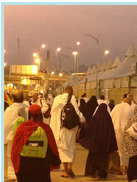
Sometimes our steps on Hajj reflect someone else's footprints

We met later. 'I'll do Mom's Badl Hajj,' the Sheigh told me. 'I cannot let such a deserving cause slip by,' he added. I had tears in my eyes. 'You could have earned three times the amount,' I said. 'I am sure I am going to earn more than that in reward,' he smiled. We sorted out the formalities. Later that evening I called my friend to inform him about the changes. I assured him that the Imam was a person of good character. My friend, a wealthy person, was perplexed and I explained what transpired. 'I'll see to it that the Sheigh gets the same amount. Give me a