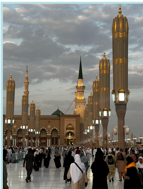
New bonds are formed during Hajj

I had a long chat with my wealthy new Hajjie friend that evening. Yes, his price will stand as long as he owns the company. When I asked him whether he would be making a loss, he laughed and said I must not worry. But I was worried. I gently explained to him the situation of my current supplier and indicated that we unfortunately would not be taking up his offer. He understood. 'Is there any way I can assist you in whatever project?' he asked. 'Do you know of any bursary funds?' I enquired. It transpired that his companies had more than one such fund. 'Would you consider funding two deserving university students?' was my request. His reply? 'Consider it done.'